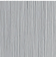
Natural anodized - ANA